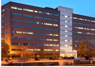
France Place 3601 Minnesota Dr Bloomington, MN 55435