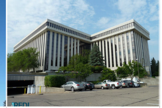
Northland Center I 3500 American Blvd W Bloomington, MN 55431