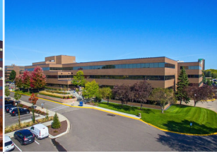
7700 France Ave S 7700 S France Ave Edina, MN 55435